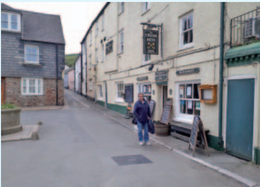
The Cross Keys