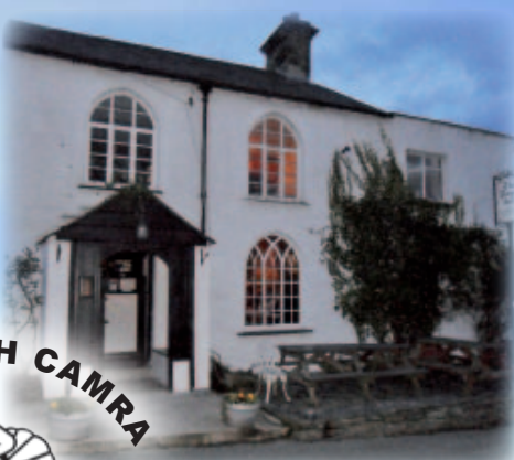
Royal Inn - Horsebridge