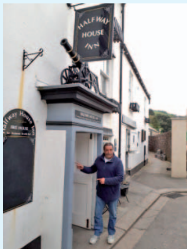
No prizes for guessing this one