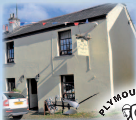
Olde Plough - Bere Ferrers