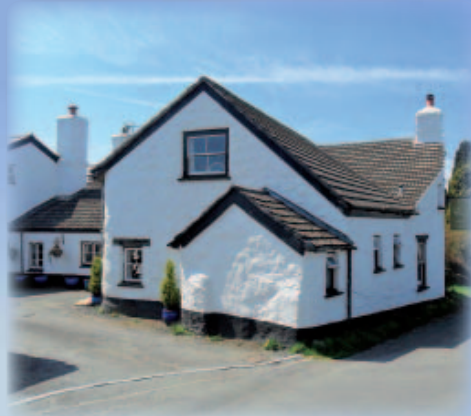
Elephants Nest - Horndon