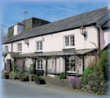
Castle - Lydford