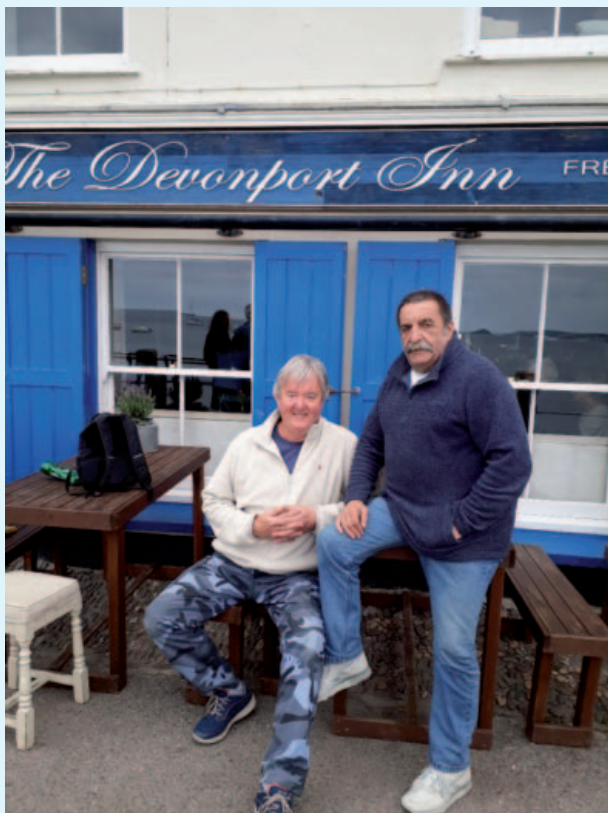
And yes, it's the Devonport Inn