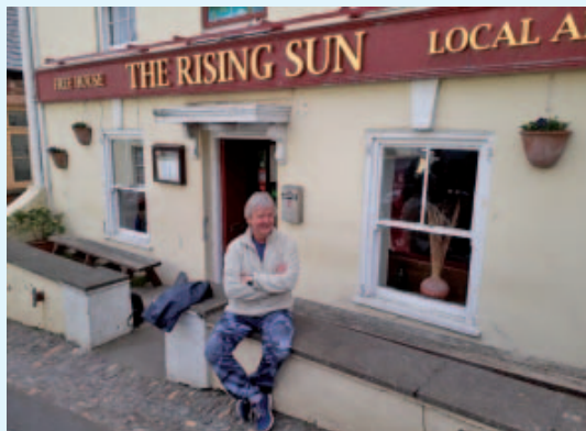
Guess which pub?